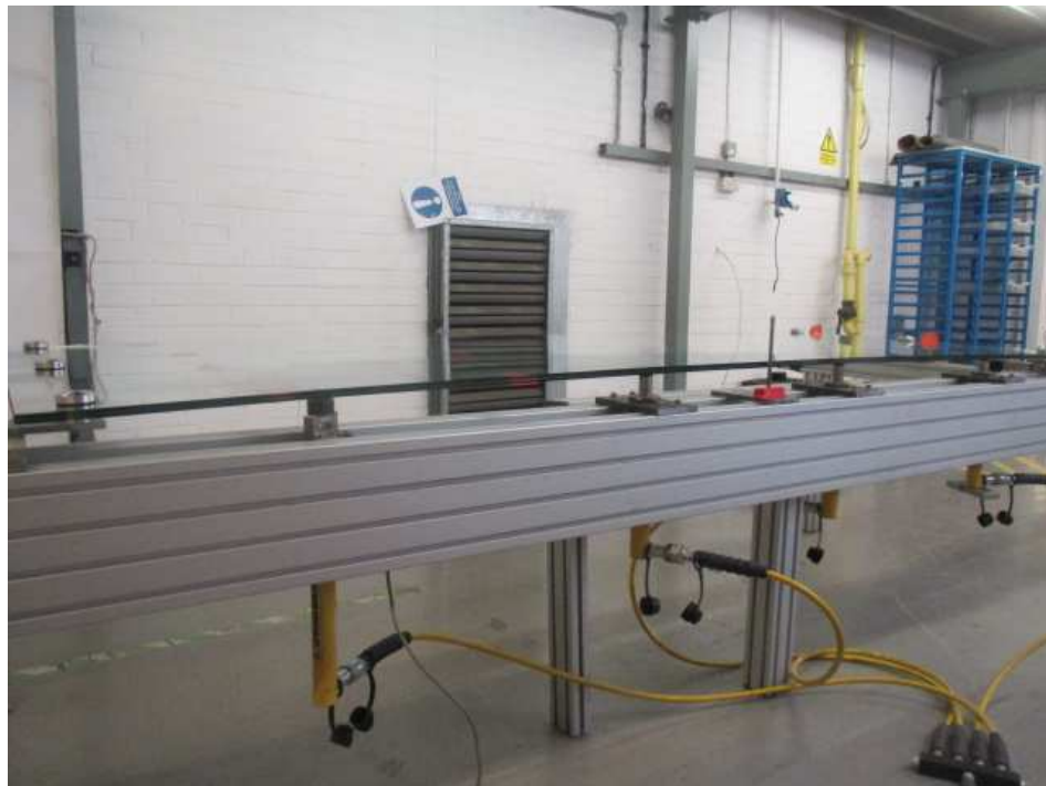
Plate 4: 3000mm x 1100mm Panoramic Frameless Juliet Balcony