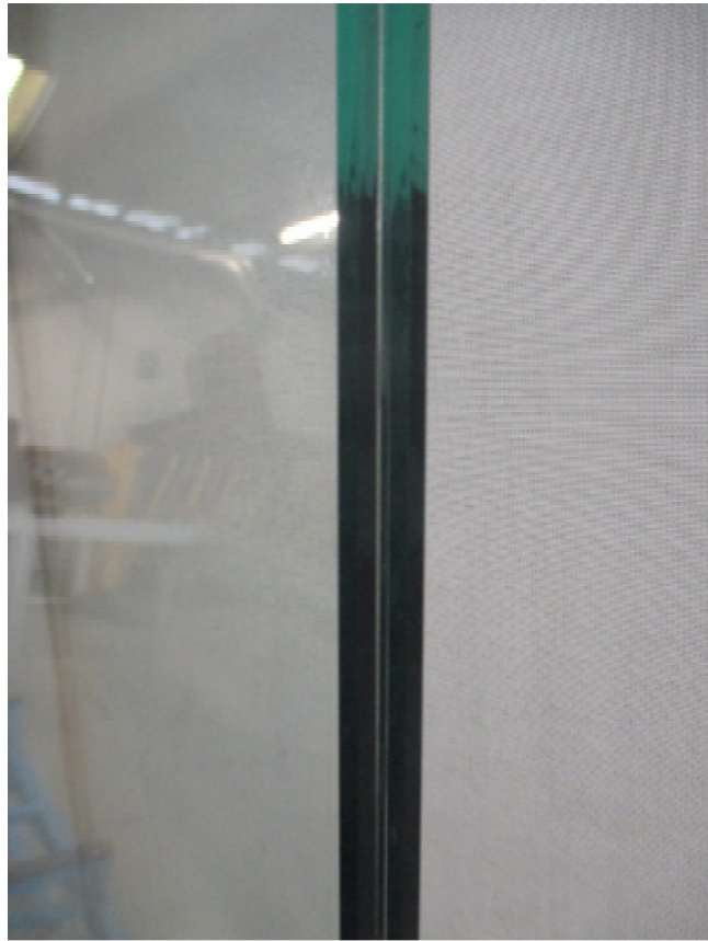
Plate 3: 3000mm x 1100mm Panoramic Frameless Juliet Balcony