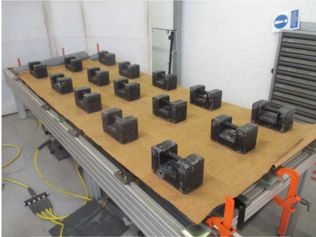
Plate 5: 3000mm x 1100mm Panoramic Frameless Juliet Balcony