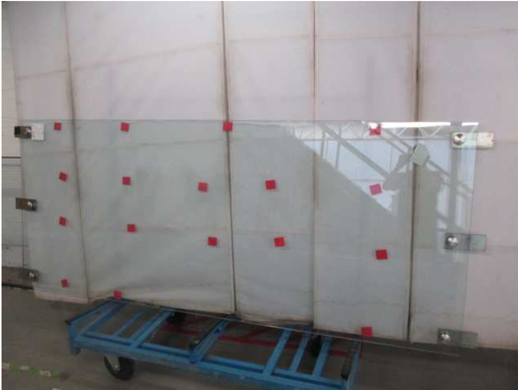
Plate 1: 3000mm x 1100mm Panoramic Frameless Juliet Balcony