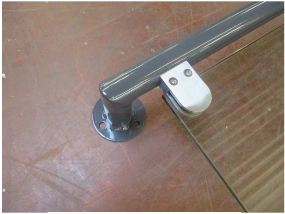
Plate 2: 3000mm Matanuska Glass Juliet Balcony