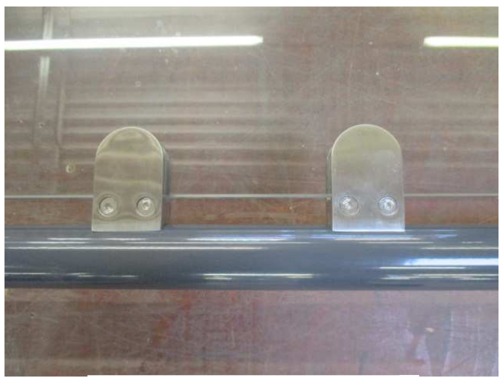
Plate 3: 3000mm Matanuska Glass Juliet Balcony