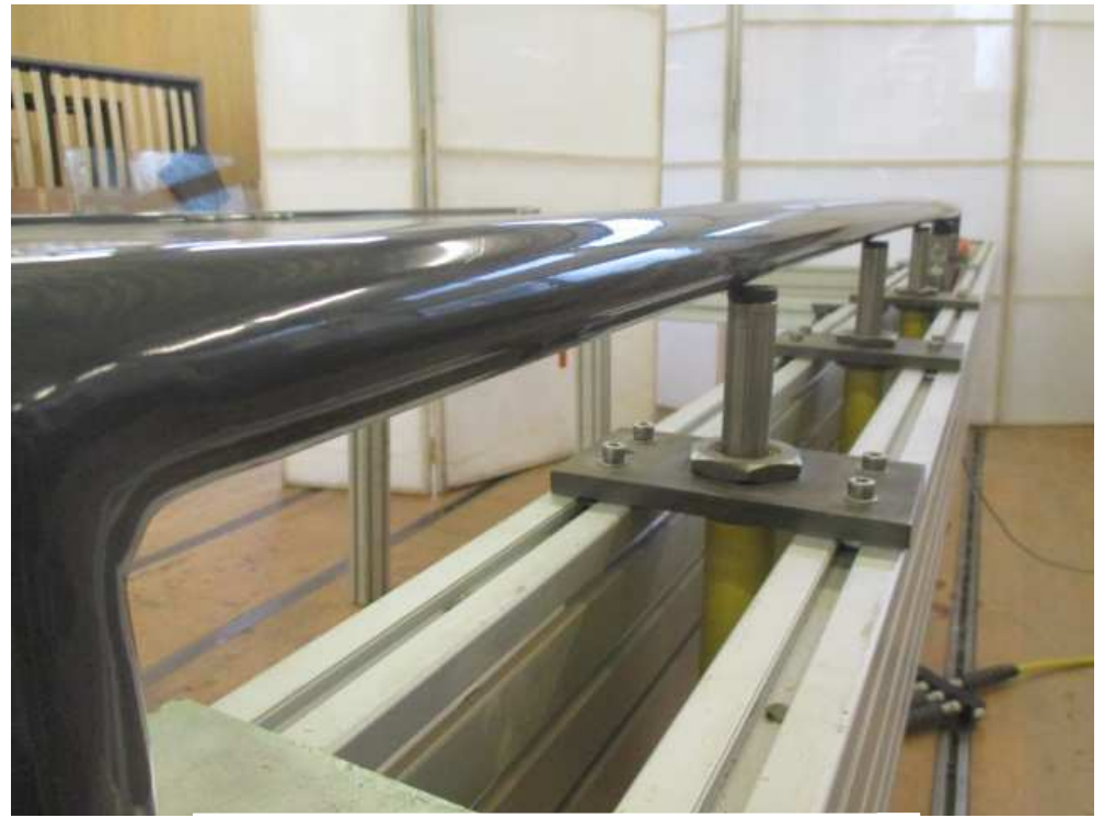
Plate 4: 3000mm Matanuska Glass Juliet Balcony