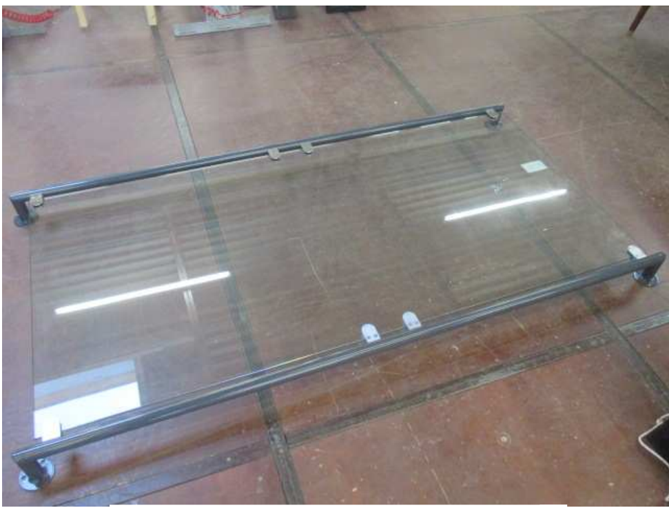
Plate 1: 3000mm Matanuska Glass Juliet Balcony