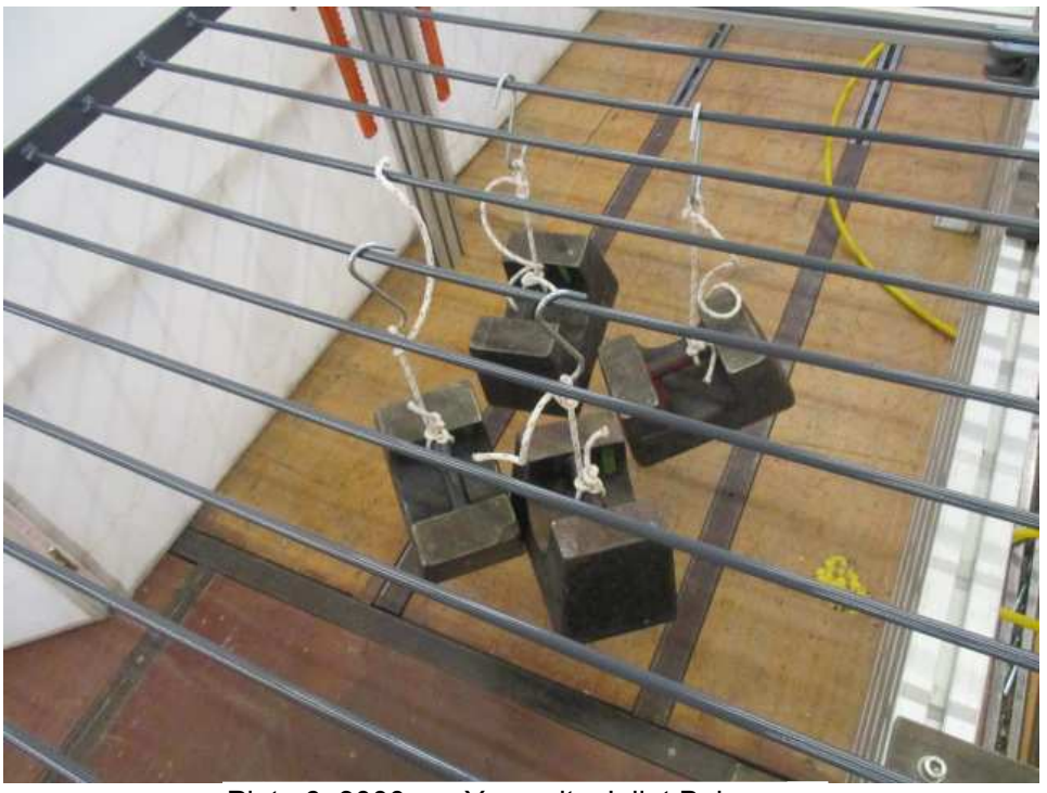
Plate 6: 3000mm Yosemite Juliet Balcony