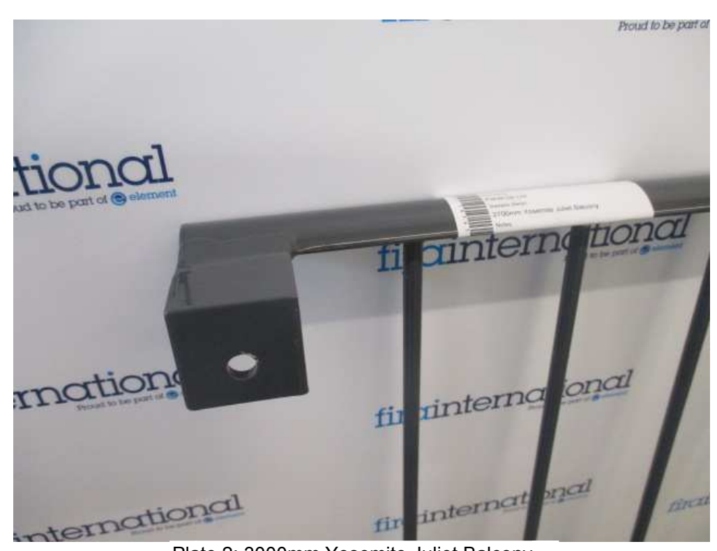
Plate 2: 3000mm Yosemite Juliet Balcony