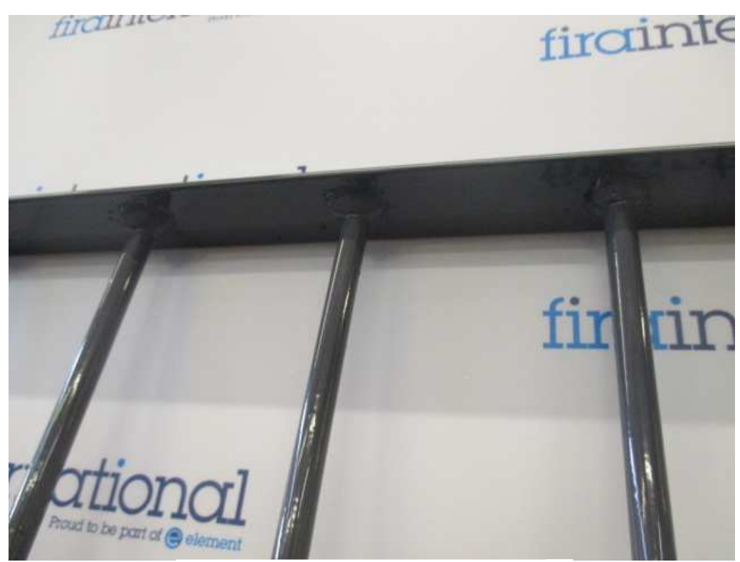
Plate 3: 3000mm Yosemite Juliet Balcony