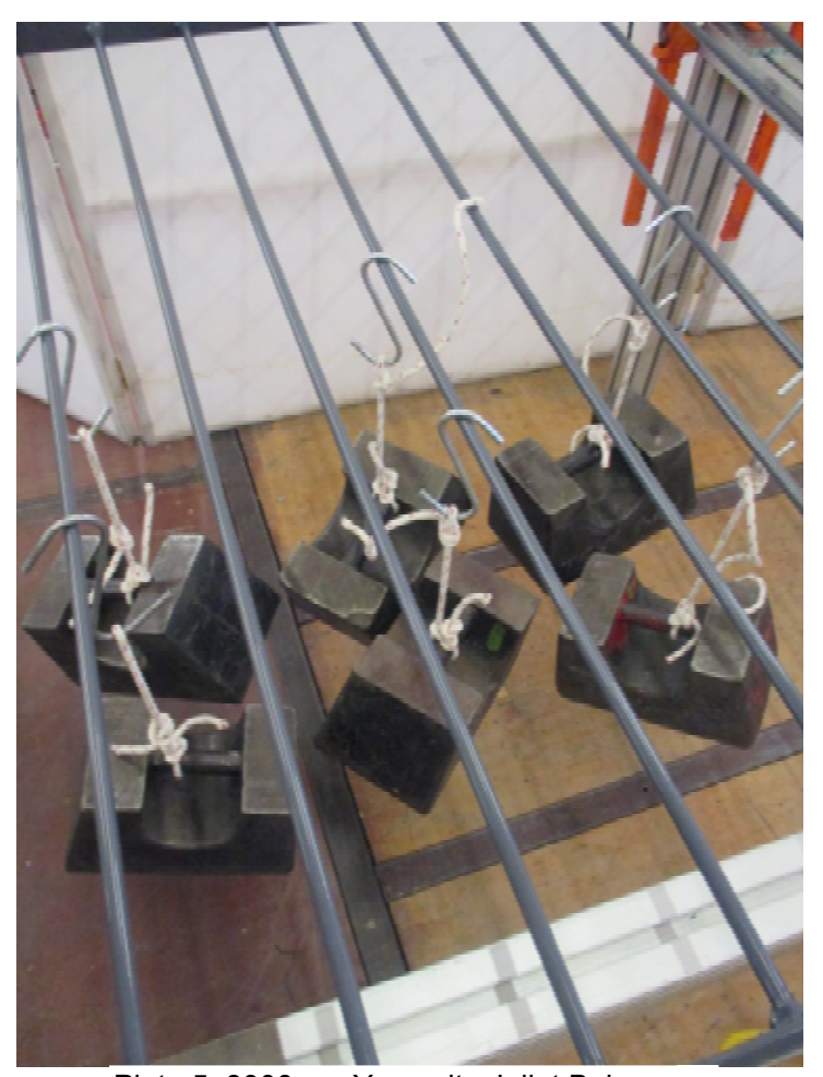
Plate 5: 3000mm Yosemite Juliet Balcony