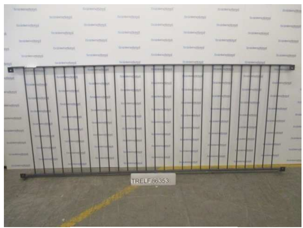
Plate 1: 3000mm Yosemite Juliet Balcony